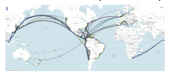
Figure 2: Liner service connectivity of Panamanian ports<sup>6</sup>

It is no secret our port system is a key to our success, but what happens beyond the ports might become even more critical in the future. The transshipment business relies heavily on the Atlantic-Pacific links offered by the inter-oceanic railroad and the road system between Panama City and Colon but, perhaps more importantly, on a set of procedures and regulations that allow for special treatment of transshipped cargo. The Colon Free Zone has cemented its role as a distribution center for Latin America and the Caribbean, and the new developments around the Canal —such as the Panama-Pacifico Special Economic Area and the proposed Corozal port—should be able to accommodate the growth expected from increased global trade, but they should also have the capability to adapt to a more uncertain environment. We should not understate the importance of our good air connectivity, which allows an extended offer of modes of transportation for cargo. It becomes evident we have world-class assets, but we still face significant challenges both on the physical plane and beyond.